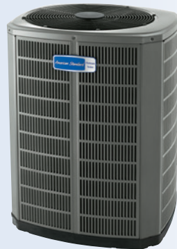
AccuComfort™ Platinum 20

American Standard Platinum air conditioners offer our highest combination of performance, efficiency, and temperature control. Built with American Standard's commitment to quality throughout, the Platinum line offers advanced energy-saving features like Duration™ variable speed compressors and Spine Fin™ coils.