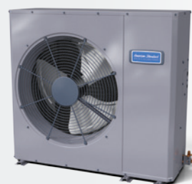
Silver 16 Low Profile