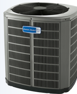
AccuComfort™ Platinum 18